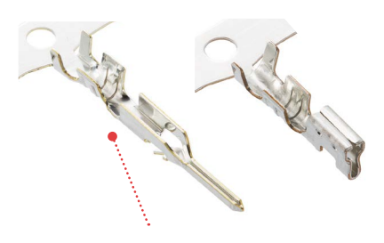
Housing lance fastened with terminal Provides improved terminal retention