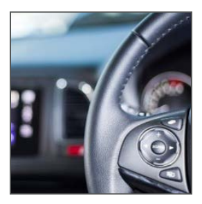
Steering Wheel Switches