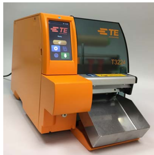
T3224 fitted with a Cutter & catch tray