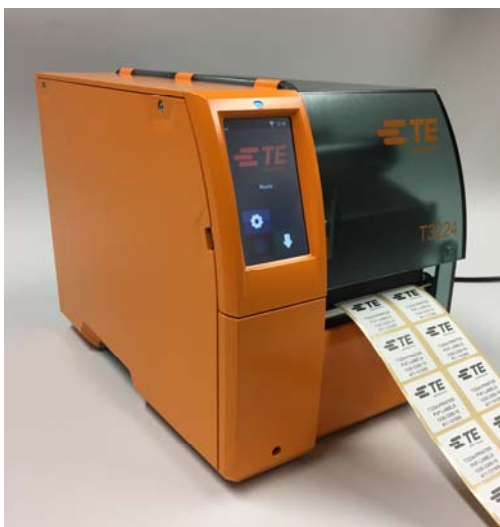
T3224 printing labels

For more details regarding printer accessories please consult TTDS-260, and for more details concerning the Universal payoff please consult TTDS-259.